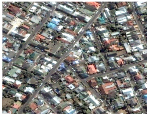
A settlement in Cape Town